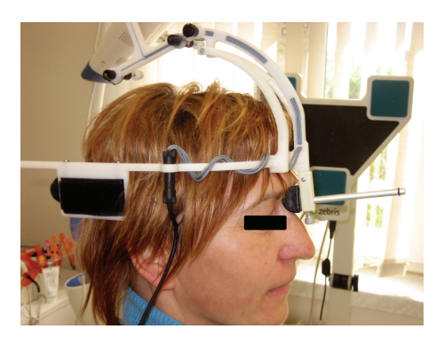
FIGURE 2: Patient during the cervical spine movements' examination.

Thanks to the repeatable measurements, values were found describing the cervical spine ROMs, presented in the form of relevant graphs.