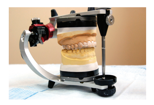
FIGURE 3: SVED appliance.

According to many researchers, there is no ideal way to handle the problem of control treatment, especially in splint studies. The use of a placebo control group can balance the nonspecific effects in the treatment group and allow for independent assessment of the real treatment effect [14]. In our study control, subjects were instructed to self-control clenching and other parafunctional habits.